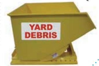
Plants, Trees, Soil, Mulch, Flowers