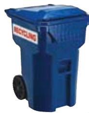
Plastic Beverage Bottles, Soda Cans, Paper and Newspapers Must Be Clean