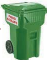
Food Scraps (Includes Meat, Bones, Dairy)