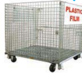
Film Plastic, Shrink Wrap, Bubble Wrap, Plastic Bags, Sheet Plastic Must Be Clean and Dry. No Strapping, Paper, Food Scraps.