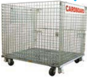
Corrugated Cardboard, Cardboard Tubes