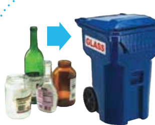
Glass Bottles and Jars Must Be Clean