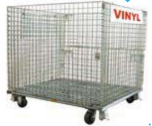
Vinyl tablecloths No Banners