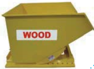
Lumber, Plywood, Particle Board, Scraps