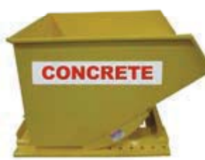
Concrete, Brick, Porcelain, Pavers, Asphalt